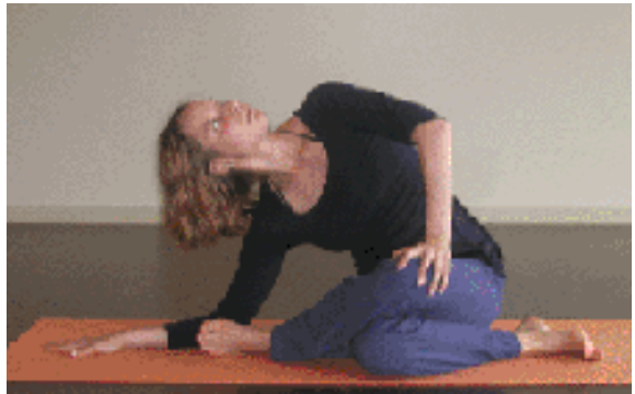
Shoelace with Sidebend

• Lean back to release the hips and slowly straighten the legs.