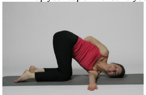
Arm behind back version